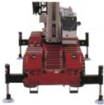
Intermediate Extended Outriggers 15' 6" (4.72 m) spread