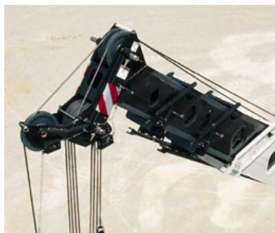
Basic boom extend mode

A customer benefit which enhances the 8050's performance and provides the operator the capability to match the crane's configuration to specific jobsite conditions. For maximum tip height the basic boom extension mode offers a full power, synchronized mode of telescoping all sections proportionally to 110' 0" (33.53 m). To enhance performance, the exclusive A -max mode (or mode 'A') extends only the inner mid section to 60.3' (18.38 m) offering substantially increased capacities for in-close, maximum capacity picks.