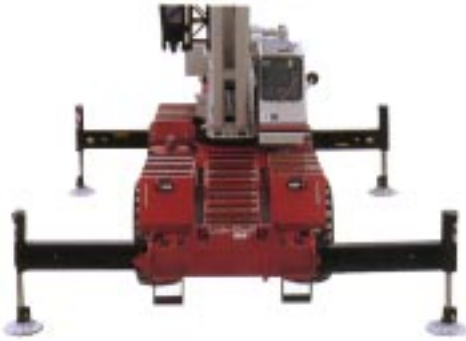
Fully Extended Outriggers 22' 0" (6.71 m) spread

The RTC-8050 rough terrain crane is specifically designed to allow contractors to work in confined work areas where full outrigger extension is not possible. The CALC system provides the operator with three outrigger positions (full extension, intermediate, and fully retracted). Outriggers may be extended to an intermediate position where working area is limited or, in extremely tight quarters, lifts can be made with outriggers fully retracted. In the fully retracted outrigger mode, lift capacities are significantly improved over the 'on tires' configuration because of the ability to fully level the machine, no matter the ground conditions.