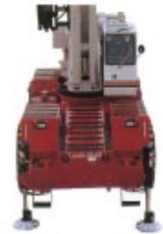
Fully Retracted Outriggers 9' 3/4" (2.76 m) spread