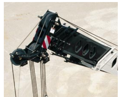
Exclusive A -max boom extend mode